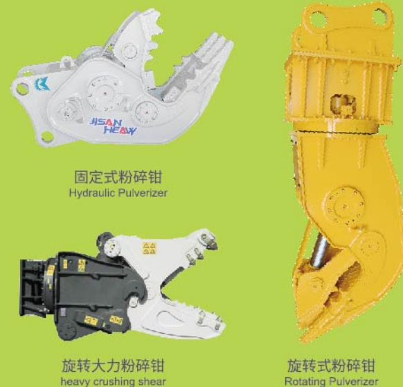
固定式粉碎钳 Hydraulic Pulverizer

Applicable objects: Demolition operations such as separating reinforced concrete. Main features: Made of Swedish Hardox 500 steel, lightweight and wear-resistant; The pin is made of 42CrMo alloy steel with high strength and toughness; Rotary type uses Swiss imported rotary motor; Oil cylinder adopts honing tube, imported HALLITE oil seal, long life; The knife block is made of wear-resistant alloy steel, which is resistant to high temperature and deformation.