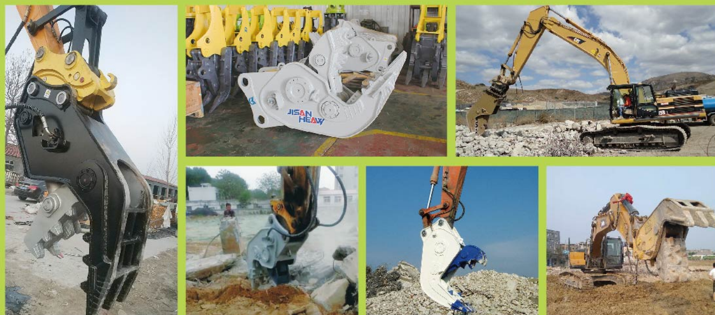
旋转式粉碎钳 Rotating Pulverizer