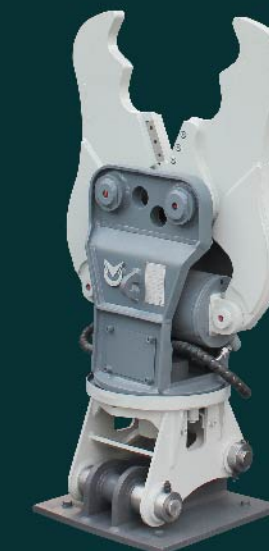
单缸小型液压剪A Single-cylinder Shear