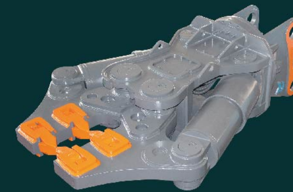
双缸液压剪 Double-cylinder Shear

Applicable objects: crushing and shearing operations such as building demolition and steel shearing. Main features: Made of Swedish Hardox 500 steel, lightweight and wear-resistant; The pin is made of 42CrMo alloy steel, with built-in oil passage, high strength and good toughness; Rotary motor adopts Swiss imported motor, full-angle rotation; The oil cylinder adopts honing tube, imported HALLITE oil seal, short working cycle and long life; The knife block is made of wear-resistant alloy steel, which is resistant to high temperature and deformation.